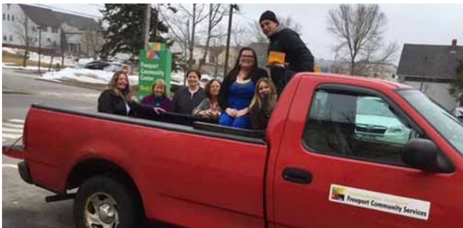
The FCS staff is looking to retire the the current truck for a new one.

FCS recently received a grant award from the Stephen and Tabitha King Foundation to replace the current truck at the Community Center. The STK Foundation promotes strengthening and supporting communities and has a special interest in organizations and people who have less recourse to usual channels of resources, focusing on community-based initiatives.