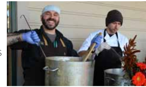
The Harraseeket Inn dishes up some chowdah.

We offered something different for dessert this year with homemade apple crisp from apples donated by Thompson's Orchards of New Gloucester and an a la mode version topped with Ben & Jerry's vanilla ice cream along with coffee and tea donated by Starbucks. Poland Spring donated bottled water.