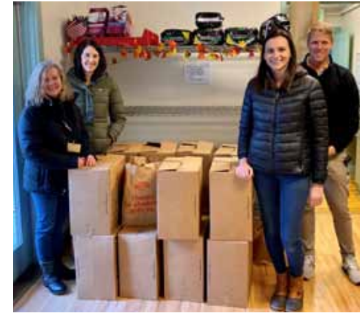
The LL Bean crew with their amazing fall food donation.