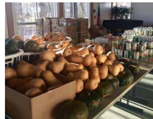
Food is ready for packing into Thanksgiving dinner boxes

Last year FCS provided 400 children and adults with food and gifts during the holidays. We expect as many, or more this year through our Holiday Helpline.