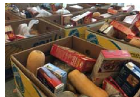
Food boxes ready for distribution.

Please help our community by supporting FCS and making a special gift this year of $50, $100, or more if possible. You may use the enclosed envelope or make a payment online via PayPal by going to fcsmaine.org and "Donate" at the top of the page. Your gift really does matter. Thank you.