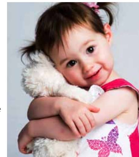
The Holiday Helpline program provides smiles as well as gifts!